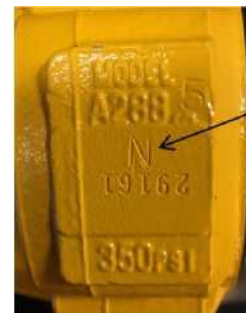
"N" Stamp on Housing

Алматы (7273)495-231 Ангарск (3955)60-70-56 Архангельск (8182)63-90-72 Астрахань (8512)99-46-04 Барнаул (3852)73-04-60 Белгород (4722)40-23-64 Благовещенск (4162)22-76-07 Брянск (4832)59-03-52 Владивосток (423)249-28-31 Владикавказ (8672)28-90-48 Владимир (4922)49-43-18 Волгоград (844)278-03-48 Вологда (8172)26-41-59 Воронеж (473)204-51-73 Екатеринбург (343)384-55-89 Иваново (4932)77-34-06