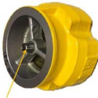
Steel Relief Stem

New LPG metering systems that include Back Check Valves and Back Check Valves purchased on or after 02/01/2017 will feature the A2885 with new product design. Valves with the new design are differentiated by a steel relief stem and the external marking stamp of "N" on the valve housing.